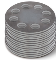
Without Rapid Part

Parts produced using the same cutting machine, the same cut speed and the same cutting time duration.