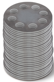
With Rapid Part

When purchasing a new cutting table be sure to ask about cut-to-cut cycle time. Some cutting table manufacturers are able to deliver similar results using their own CNC, THC, and nesting software products combined with Hypertherm plasma systems.